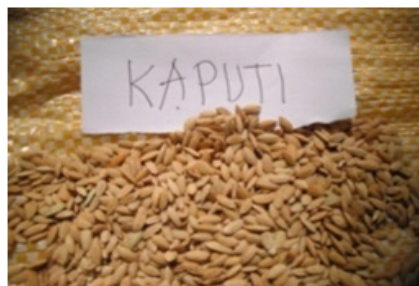
Kaputi - Small grain, (L-6.8mm, W-3mm) pale cream skin, reddish flesh, aromatic, soft when cooked.