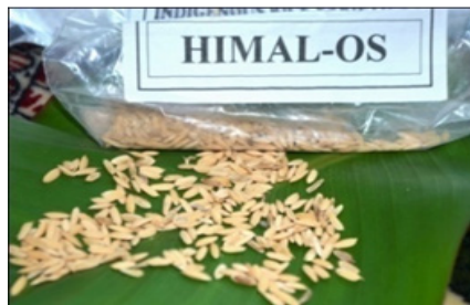
Himal-os - Bigger elongated grain, (L-7mm, W-4mm) creamy skin, white flesh, not aromatic soft when cooked, adapted to lowland condition.