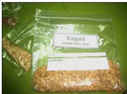
Kagaid - Bigger elongated grain, (L 9mm, 4mm) light brown skin, creamy flesh, soft and sticky when cooked