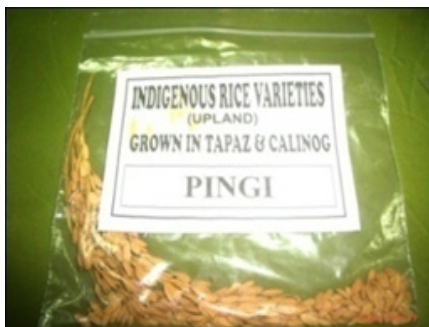
Pingi - Rounded skin, creamy flesh, (L-10mm, W-5mm) aromatic, soft when cooked