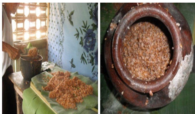
Making of Rice Wine ( Paghibong it Pangasi ) Plate 1. The Rice Wine ( Pangasi )

set and the parties should see to it that their respective share will be consumed without losing their control. In that manner, it is believe that their families will be living harmoniously. In case one party gets into trouble due to drunkenness, it will be a bad sign that the relationship of the family will become bitter and chances are the elder may not allow the marriage to push through, Pangasi is also used during rituals and thanksgiving wherein the babaylan (quack doctor) include the rice wine as part of the food, usually native delicacy from fancy rice like alope , baye-baye , ebus , muasi , but-ong , suman with native chicken or wild pig or black pig. They also use sea foods such as crabs or kalampay and shrimps or urang and banag . The kumbidahan is the highlight of the ceremony wherein they invite the dead elders uttering their names and praying.