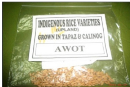
Awot - Bigger rounded grain, ( L7mm, W4mm) golden brown skin, flesh is white with dark spot at the tip, aromatic and soft when cooked