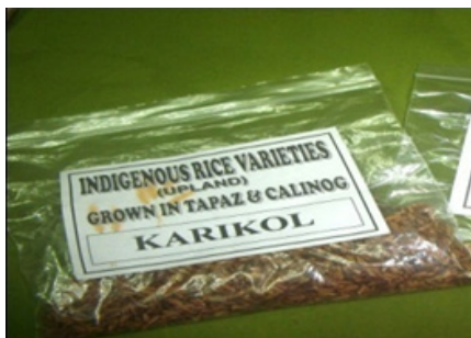
Karikol -Purple skin, (L-7mm, W-4mm) medium elongated grain, white flesh, aromatic, soft when cooked.