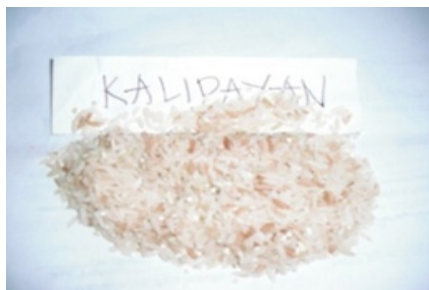
Kalipayan -Small elongated grain, (L 6.5, W 3.5) pinkish flesh, aromatic, soft when cooked.