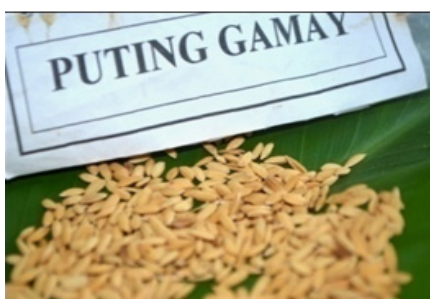
Puting-gamay -Small grain,( L-6.5mm, W-3.8mm) pale skin, white flesh, aromatic, soft when cooked