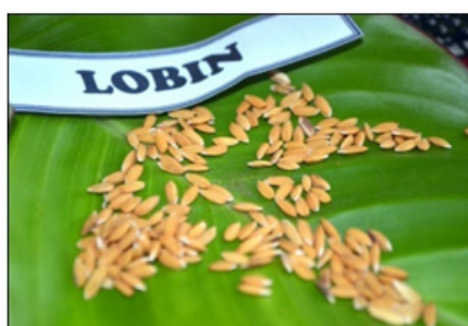
Lobin - Grain medium-sized, (L-7mm, W-4mm) rounded; skin color is pale brown, white flesh, aromatic and soft when cooked.