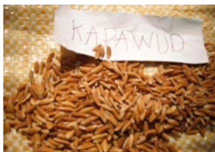
Kapawod - Bigger grain, (L 9mm, W4mm) reddish brown skin, white flesh, aromatic soft when cooked.