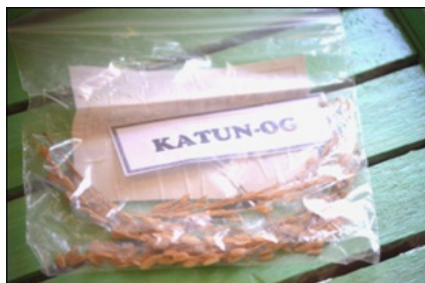
Katun-og - Small elongated grain,(L-7 mm, W-4mm) creamy skin, white flesh, aromatic, soft when cooked